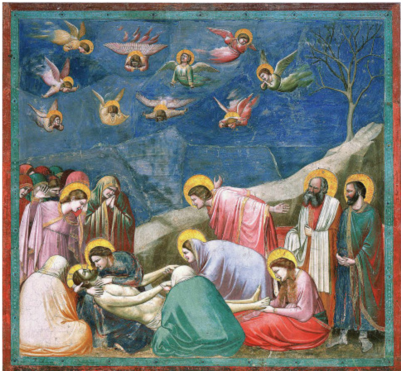
Giotto di Bondone, Lamentation (Scenes from the Lives of Mary and Christ), c. 1303–1306. Fresco, 185 x 200 cm. Arena Chapel, Padua