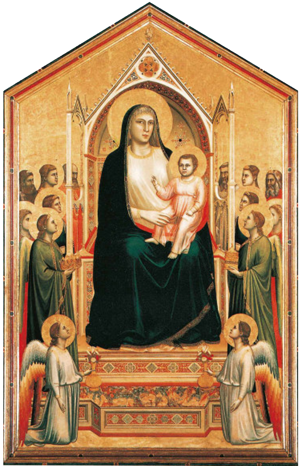
Madonna Ognissanti , 1310. Tempera on wood, 325 x 204 cm. Uffizi, Florence