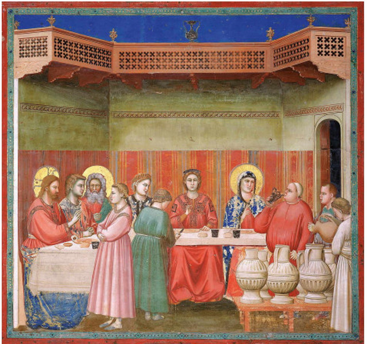
Giotto di Bondone, The Wedding at Cana (Scenes from the Lives of Mary and Christ), c. 1303-06. Fresco, 185 x 200 cm. Arena Chapel, Padua