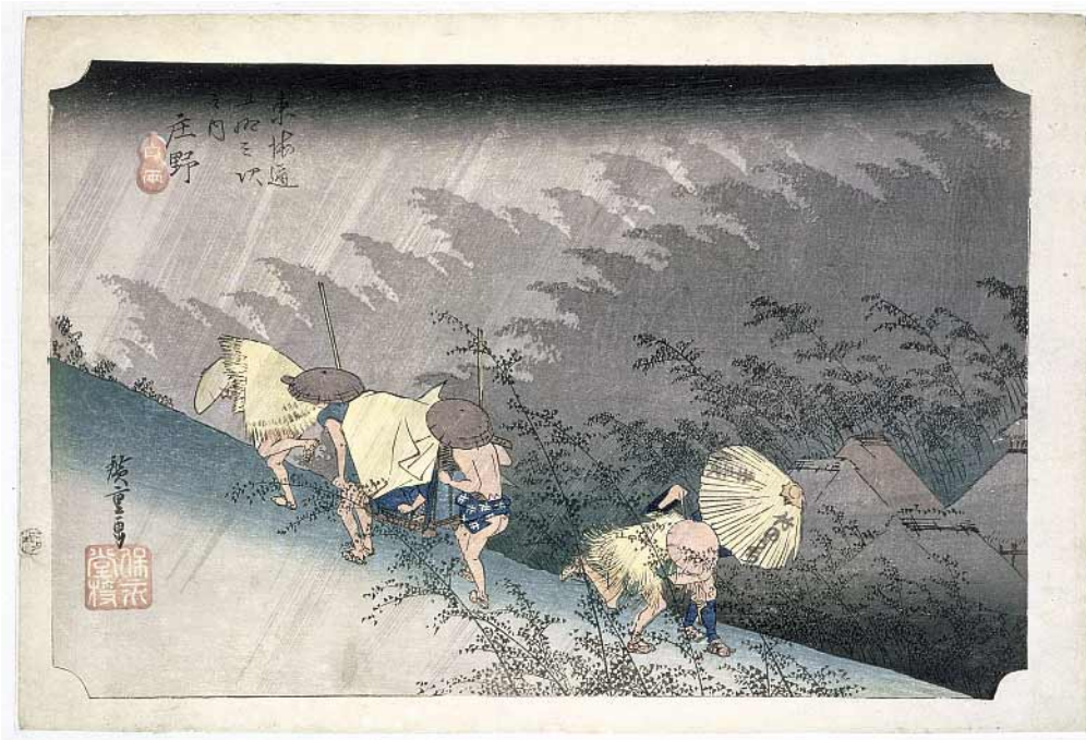
Sudden Rainstorm at Shono , No. 46 from the series "53 Stations of the Tokaido," Ando or Utagawa Hiroshige, woodblock print, 1833, Victoria & Albert Museum, London

the Rococo, the Aesthetic movement, Symbolist art, and aspects of Japanese design. Unlike the Arts and Crafts movement, however, Art Nouveau artists and designers did not shun mass production, but embraced many modern technologies, including machines. The movement was a genuine attempt to create something completely new that did not imitate the past, and that was truly international.