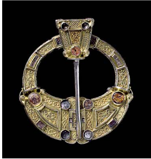
The Hunterston Brooch , silver, gold and amber, ca. 700, National Museums of Scotland, Edinburgh

Art Nouveau was an influential but relatively short-lived art and design movement and philosophy that emerged in the final decades of the nineteenth century (often called the fin de siècle ) and ended with the start of World War One. It developed almost simultaneously across Europe and America, in provincial towns as well as in capital cities, including Glasgow, Chicago, Barcelona, Paris, Bucharest, Nancy, Brussels and St Louis. A conscious attempt to create a unique and modern form of expression that evoked the spirit of the age, it was a versatile movement with huge scope and influence that manifested itself in painting, illustration, sculpture, jewellery, metalwork, glass, ceramics, textiles, graphic design, furniture, architecture, costume and fashion. Applying organic, flowing lines, Art Nouveau designers determined to escape the excessively ornamental