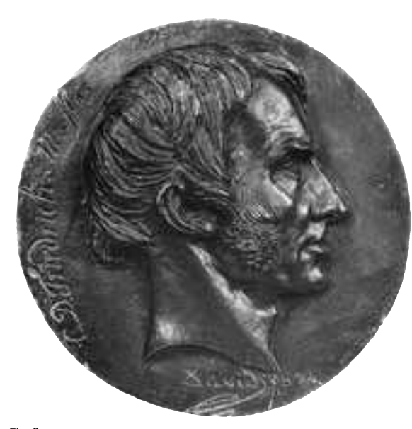
Fig. 3 Pierre Jean David d'Angers Portrait of Caspar David Friedrich 1834 Bronze medallion Musée des Beaux-Arts, Angers

Labroue's dramatisation of the portrait, in the smallest possible space, stands in the greatest possible