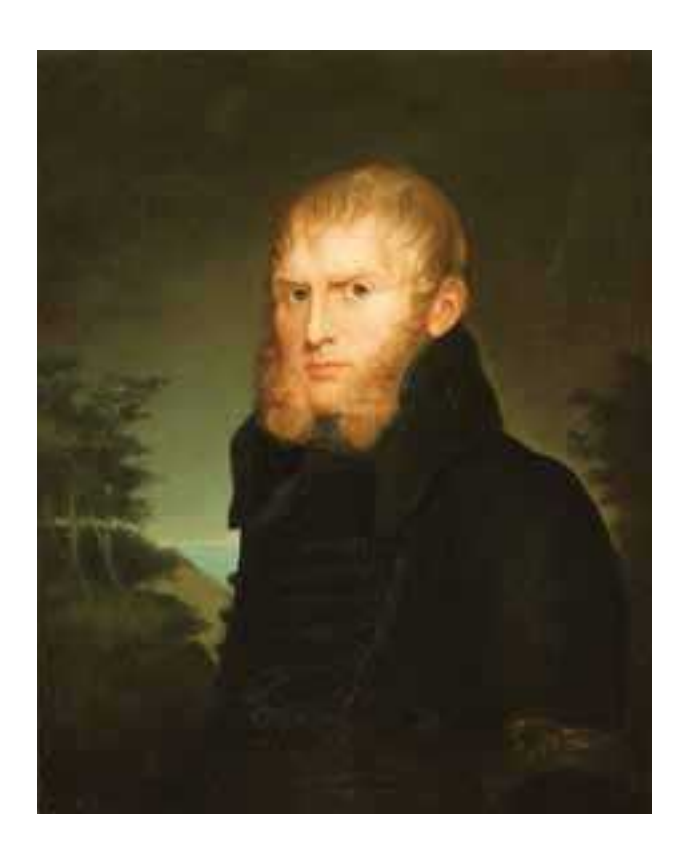
Fig. 2 Caroline Bardua Portrait of Caspar David Friedrich 1810 Oil on canvas 76.5 \times 60 \text{ cm} Alte Nationalgalerie, Staatliche Museen. Berlin