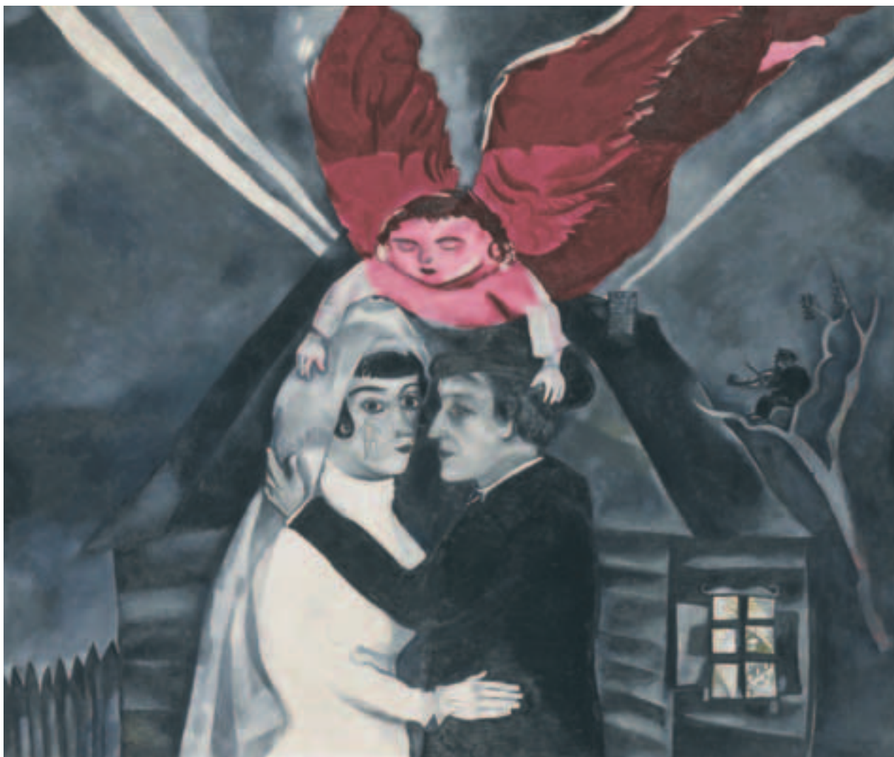
Marc Chagall The Wedding , 1918 Oil on canvas, 40 \frac{3}{8} x 47 \frac{1}{2} in. (102.5 x 120.7 cm) State Tretyakov Gallery, Moscow