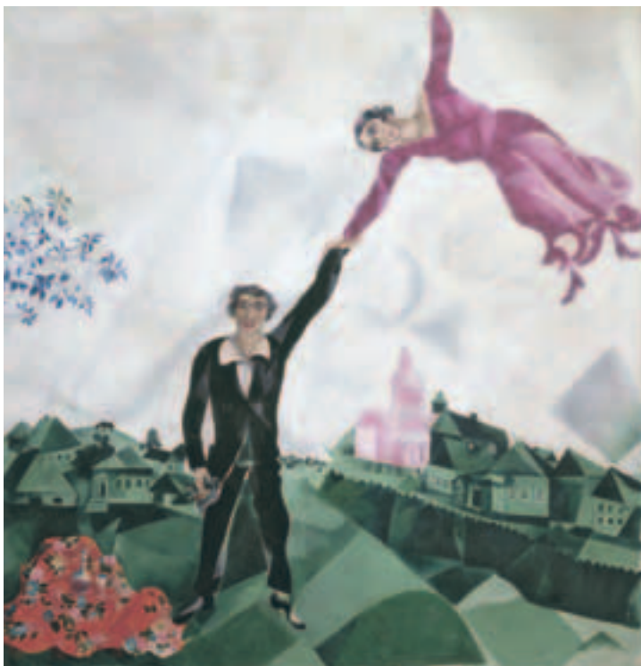
Fig. 2 Marc Chagall The Promenade , 1917–18 Oil on canvas, 68 × 66 ¼ in. (175.2 × 168.4 cm) The State Russian Museum, Saint Petersburg

it, claiming the absolute centrality of Futurism to the definition of revolutionary art. 16 Chagall's perspective in these interpretive conflicts is particularly interesting because it embodies the misunderstandings upon which his school was built. Just as Kandinsky rejected the question of form in favor of the spiritual content of art, Marc Chagall did not take style, subject matter, or the viewer into account in his vision of a revolutionary art. Instead, he relied on the proletarian consciousness of the painter, regardless of his group allegiances. "We proletarian painters," he wrote, "respect above all the value of plastic language." He opposed "all art that contains 2 \times 2 = 4 ," an art that is "not worthy of our times." He privileged "our inextinguishable inner voice," in other words, "the voice of the rebels of the world, constantly demolishing and building a new life and culture." It was critical, he argued, "to obtain the maximum of output and expression." 17