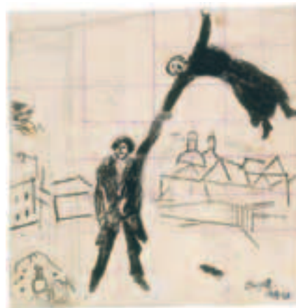
Marc Chagall The Promenade , 1919–20 New study on a theme from 1917, design for a banner and an engraving of My Life Graphite and ink on grid-lined paper, 4 15/16 × 4 13/16 in. (12.6 × 12.2 cm) Centre Pompidou, National Museum of Modern Art, Paris 1988 gift

individualist unbound by any regulatory or collectivist system. But this is precisely tantamount to squaring the circle for the artist: How to transmit such a libertarian outlook to teenaged students attempting to find their bearings in the midst of tremendous social change? How to reconcile this position with the Bolshevik mission of educating the people? Under these circumstances, one might say that Chagall's project was destined to fail, and he would not be at a loss for adversaries who sorely tested his desire to embrace different styles in the same pedagogical program.