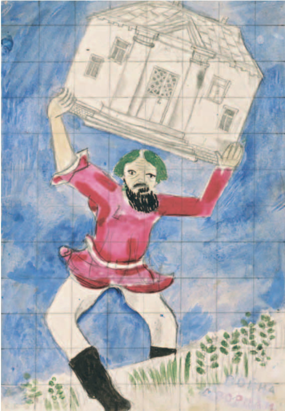
Marc Chagall Peace to Huts—War on Palaces, 1918 Design for a decorative panel for the first anniversary of the October Revolution Watercolor and pencil on paper, 13 3 / 16 × 9 1 / 8 in. (33.5 × 23.2 cm) State Tretyakov Gallery, Moscow