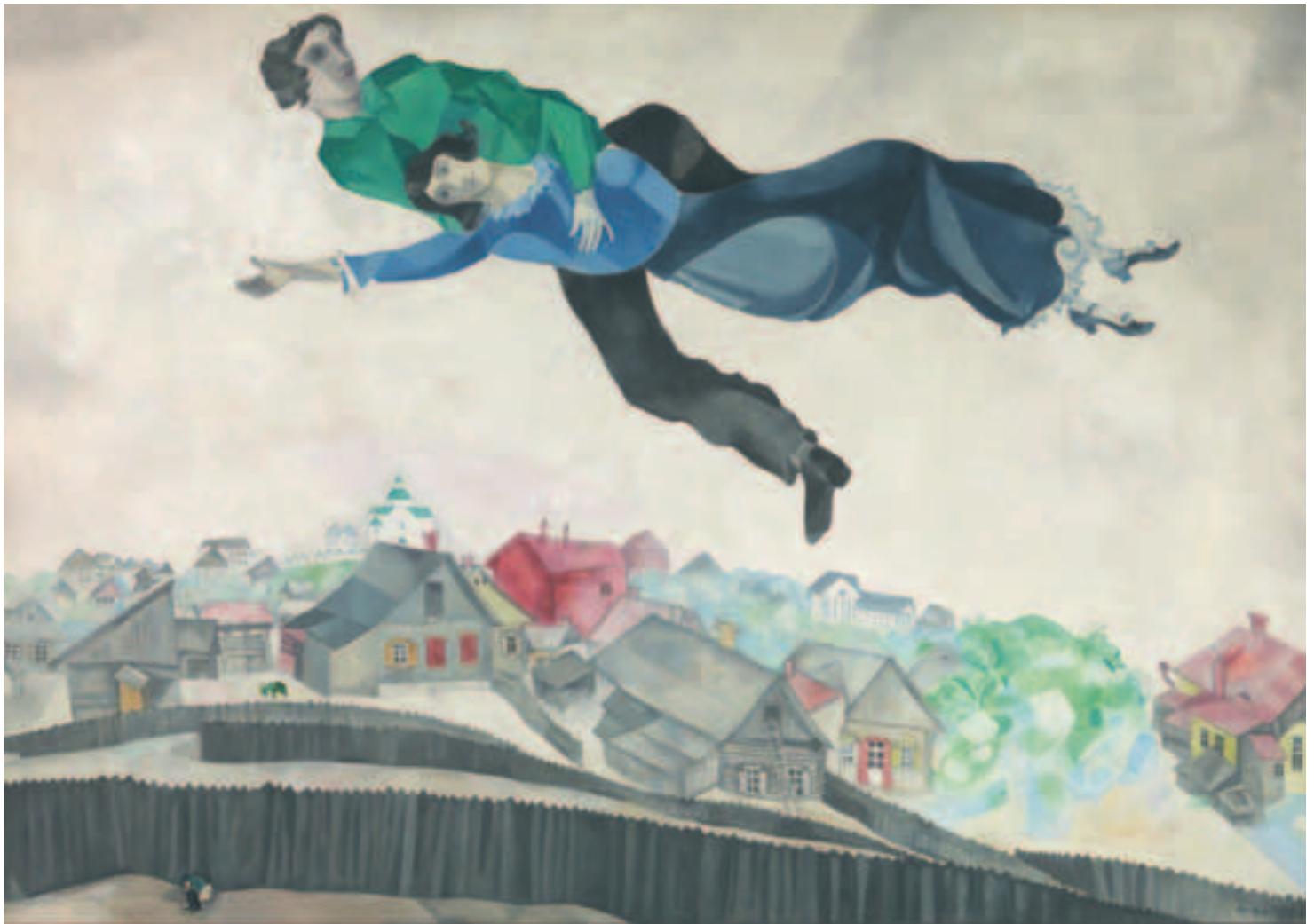
Marc Chagall Over the Town , 1914–18 Oil on canvas, 54 ¾ × 77 ½ in. (139 × 197 cm) State Tretyakov Gallery, Moscow

path: working within the new UNOVIS group, complemented by structured theoretical teaching. In the face of his progressively emptier classes, Chagall could not help but acknowledge the obliteration of his revolutionary dream. He had forgotten that he was not a servant, but a free spirit—in fact, too free.