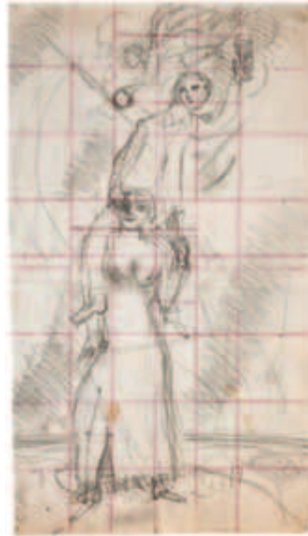
Marc Chagall Double Portrait with Wine Glass, 1917 Graphite on grid-lined paper, 13 7/8 x 7 15/16 in. (35.3 x 20.1 cm) Centre Pompidou, National Museum of Modern Art, Paris 1988 gift