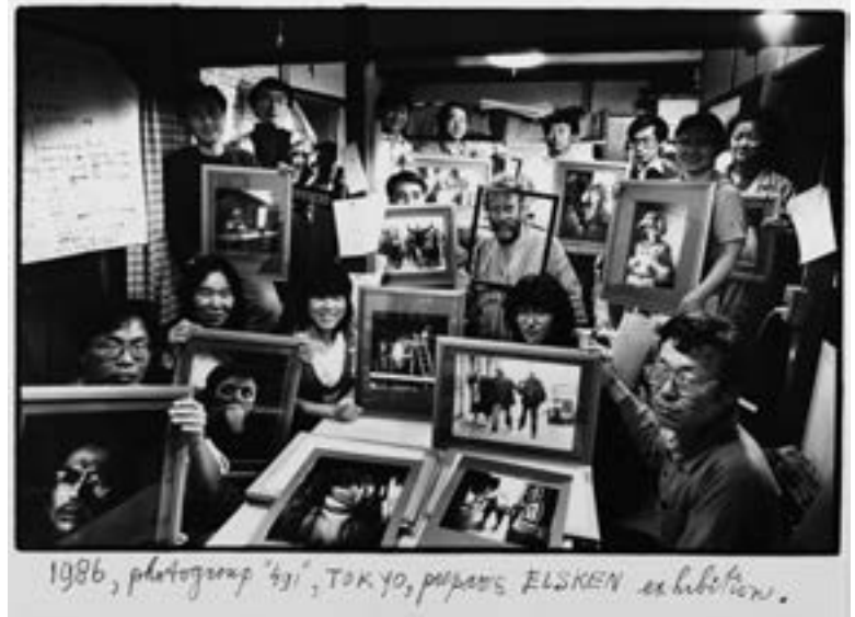
The 491 photo group preparing the ELSKEN exhibition, Tokyo, 1986

1985 Elsken: Paris 1950–1954 is published by Libroport Co. Ltd of Tokyo.