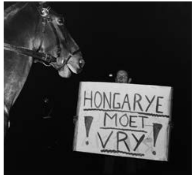
Demonstration against the Soviet invasion of Hungary, Amsterdam, 1956

The Hungarian uprising begins on 23 October. Soviet tanks roll into Budapest to suppress the protests. Van der Elsken photographs the Dutch protests against the Soviet invasion.