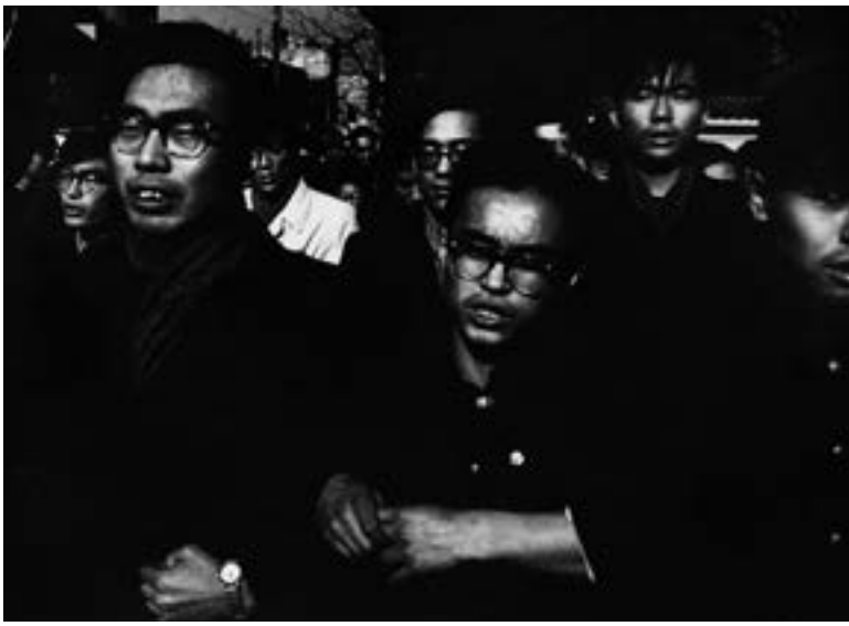
Zengakuren communist student demonstration, Tokyo, 1959

1960 Members of Zengakuren, a communist/anarchist student organization, demonstrate in Japan in the early 1960s. They protest among other things against the American occupation of Vietnam. Van der Elsken photographs their demonstrations in Japan.