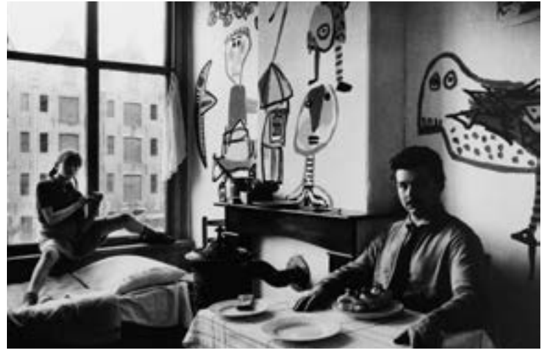
Karel Appel and one of Ata Kandó's daughters in the children's room on Achtergracht, Amsterdam, 1955

1955 Ed van der Elsken moves to Achtergracht 39 in Amsterdam, along with Ata Kandó and her three children. Karel Appel paints the walls of the children's bedrooms.