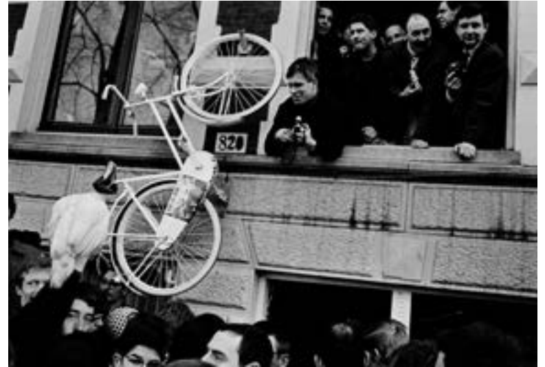
Provo demonstration against police action during the wedding of Princess Beatrix and Prince Claus, Prinsengracht, Amsterdam, 1966

hand to record the unrest in the city. In 1966, for example, he photographs the riots during the wedding of Princess Beatrix and Claus von Amsberg of Germany, and the construction workers' riots in the city centre. In 1969 he photographs the student occupation of the Maagdenhuis (the administrative centre of the University of Amsterdam). He also photographs Dolle Mina, an Amsterdam-based group that campaigns for equal opportunities for men and women and the legalization of abortion in the Netherlands.