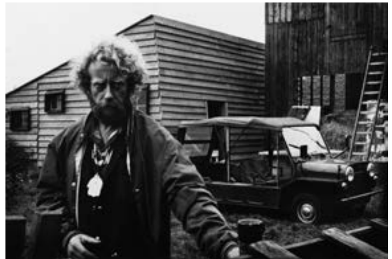
Ed van der Elsken in front of his house in Edam, c. 1973.