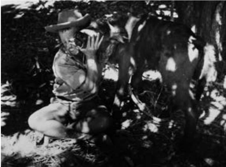
Ed in Oubangui-Chari, 1957

In December van der Elsken leaves for the Oubangui-Chari region, later Central Africa, on the border between Congo and French Equatorial Africa, to take photographs on commission for publishers De Bezige Bij.