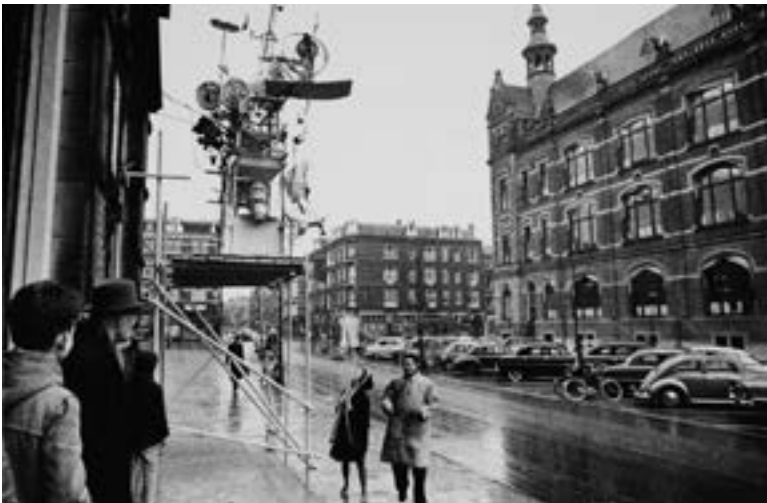
Entrance to Stedelijk Museum featuring work by Jean Tinguely during the Bewogen beweging exhibition, 1961