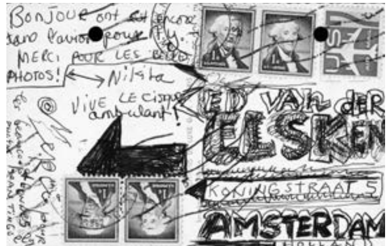
Postcard from Jean Tinguely, 1962-63