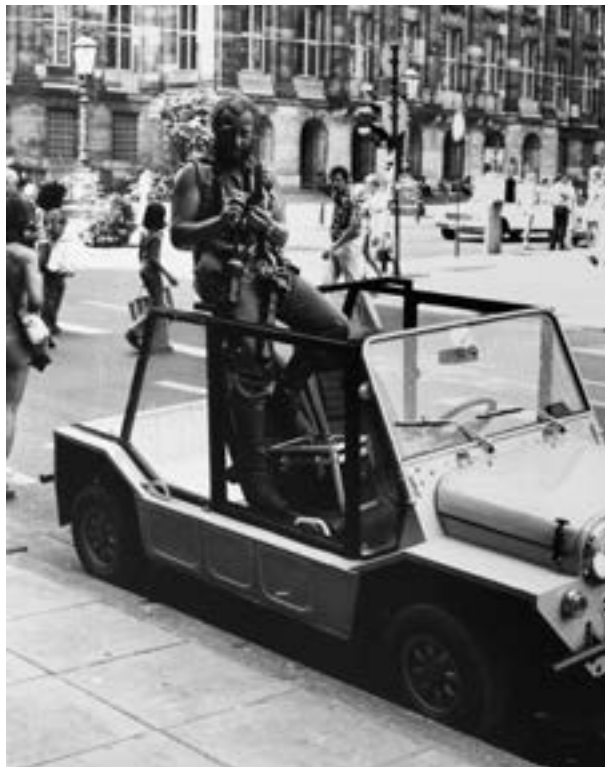
Ed van der Elsken in his Mini Moke, Amsterdam, 1977.

1982 Een fotograaf filmt Amsterdam ( My Amsterdam , literally "A Photographer Films Amsterdam"; approx. 57 min., broadcast by VPRO on 29 June 1983) is a filmic portrait of Amsterdam and its residents.