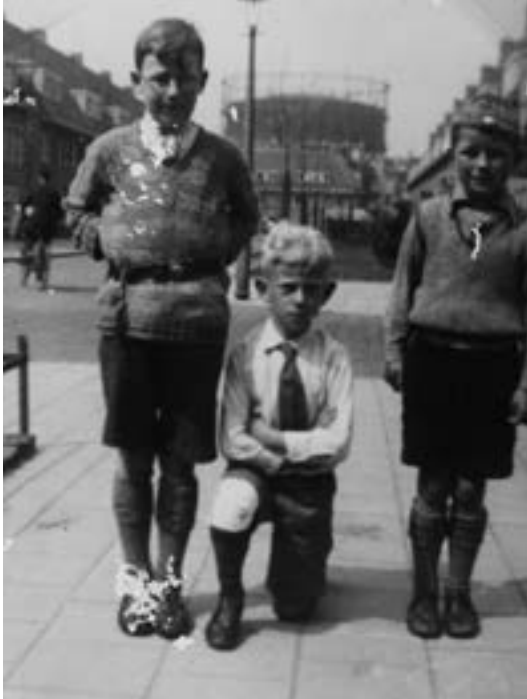
Childhood photo of Ed van der Elsken, c. 1930