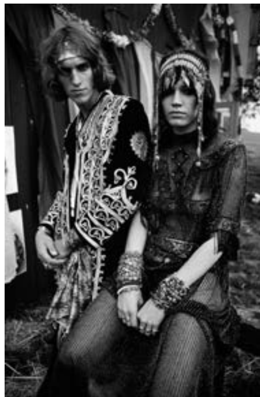
Hippies, Edam, c. 1969

1980 Avonturen op het land (Adventures in the Countryside). Van der Elsken makes both a film and a book, in colour and black and white, about his life in the countryside near Edam. The film is broadcast by VPRO on 30 March 1980.