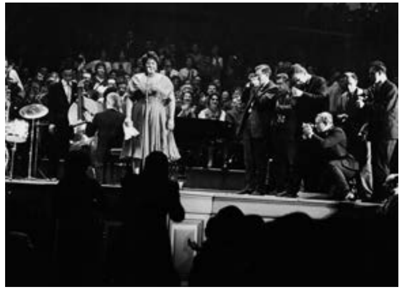
Ed van der Elsken at the Concertgebouw, Amsterdam, mid- to late 1950s.

The Stedelijk Museum Amsterdam starts a photography collection. In its first round of purchases, the museum acquires a selection of van der Elsken's photographs from Love on the Left Bank and the series on French Equatorial Africa.