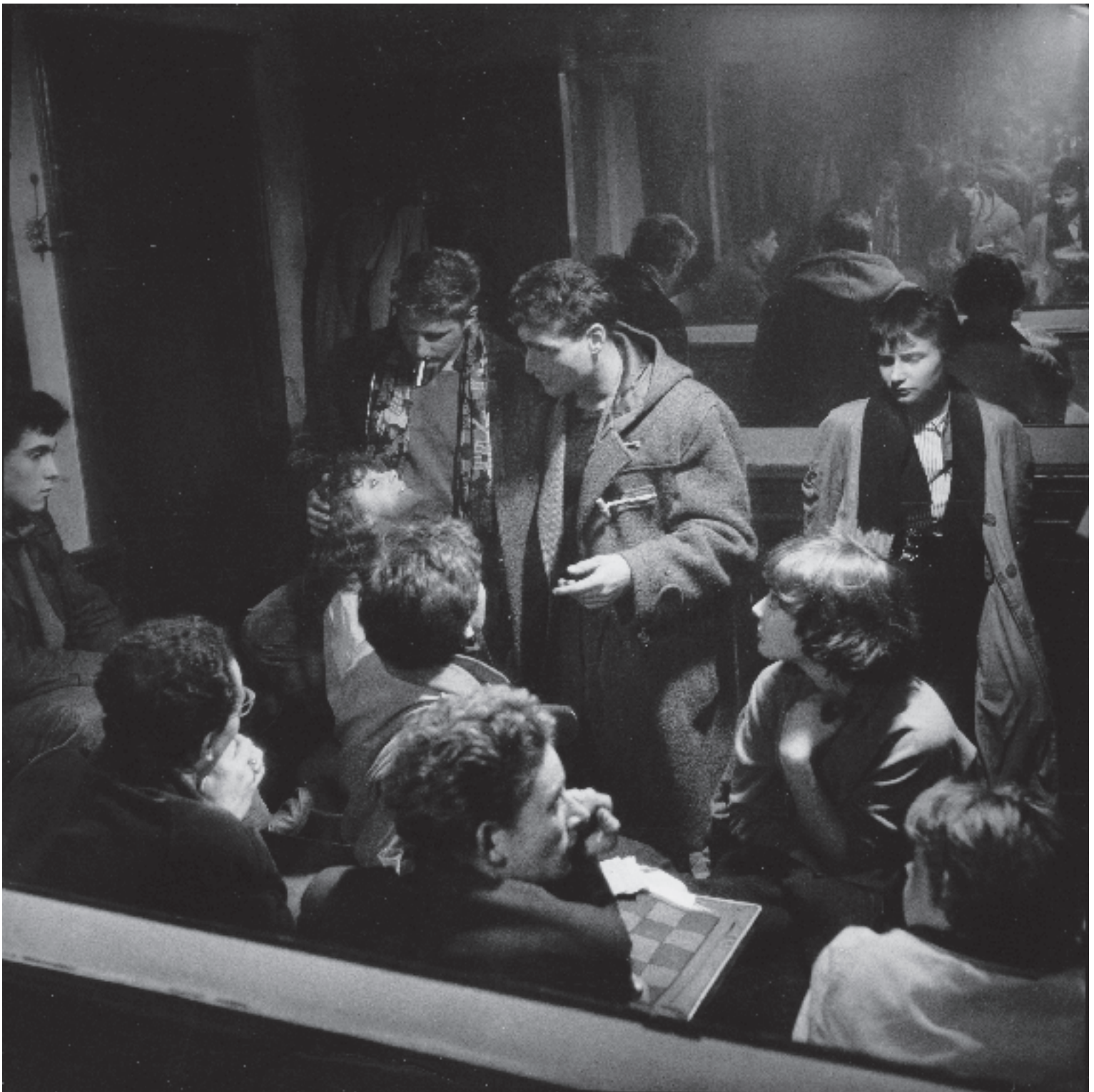
Chez Moineau, Rue du Four, Paris, 1953