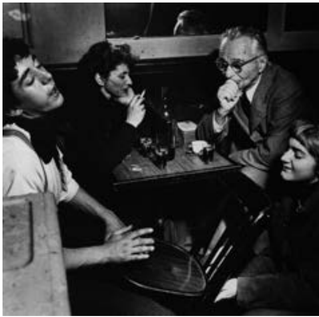
Edward Steichen and Ata Kandó, Paris, 1953

The Netherlands is hit by a severe storm on the night of 31 January. Van der Elsken is one of the photographers who takes pictures of the great flood of 1953 for the photobook De ramp (The Disaster), published by De Bezige Bij.