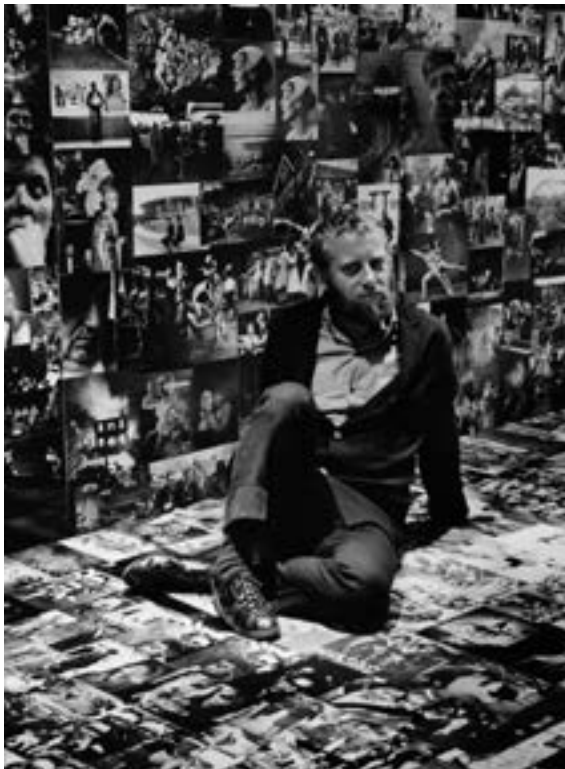
The entrance to the exhibition Hee... zie je dat?, Stedelijk Museum Amsterdam, 1966.

1966 Ed van der Elsken's book Sweet Life is printed in Japan and published in Dutch, English, French, German, Spanish and Japanese. It is followed a year later by the four-part Wereldreis in foto's , containing photographs of his round-the-world trip.