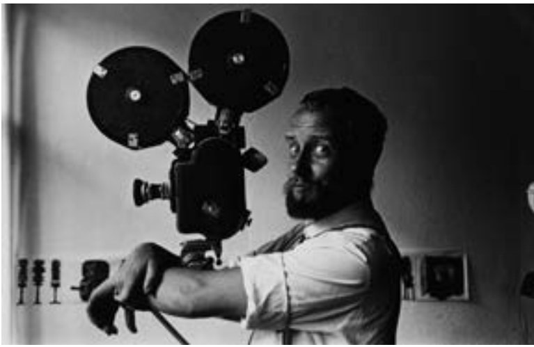
Portrait of Ed van der Elsken, 1964.

Willem Sandberg, director of the Stedelijk Museum Amsterdam, asks van der Elsken to film the Dylaby exhibition, which features a "dynamic labyrinth" designed by artists, including Daniel Spoerri, Robert Rauschenberg, Niki de Saint Phalle and Jean Tinguely, through which visitors must navigate.