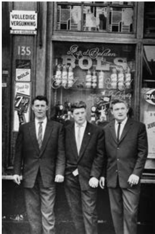
Three brothers outside their pub on Zeedijk, Amsterdam, 1958

Ed van der Elsken and Ata Kandó divorce on 16 September.