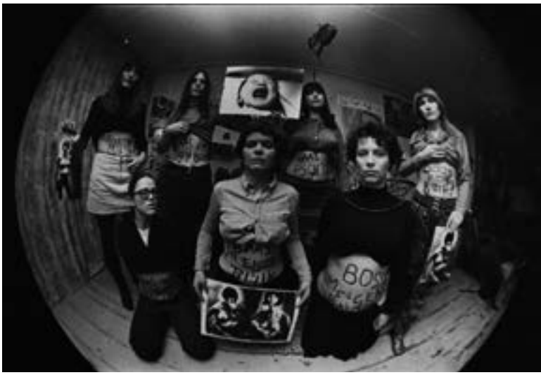
Activists of the Dolle Mina feminist group, Amsterdam, c. 1970

1965 Van der Elsken attends the short film festival in Oberhausen for the second time and makes a documentary about it.