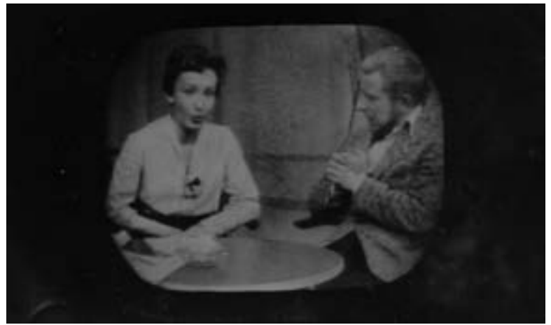
First television broadcast on Love on the Left Bank , 1 March 1955, Venster, AVRO

National television is launched in the Netherlands on 2 October 1951. Broadcasting company VARA transmits a programme about Love on the Left Bank .