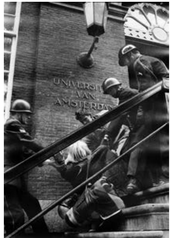
Occupation of Maagdenhuis ended, Amsterdam, 21 May 1969