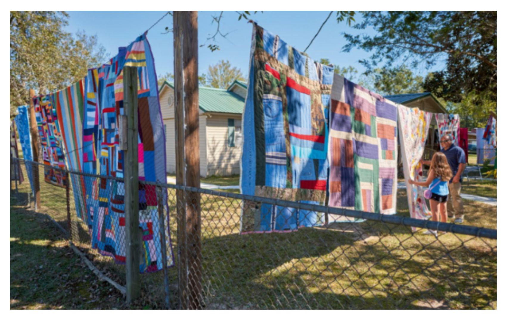
Airing of the Quilts Festival, Gee's Bend, Alabama, 2022

use of previously worn materials like old clothing and fabric scraps, were seen as unique. Suddenly the quilts transformed from functional items used to keep the body warm to museum pieces, contributing to the discussion around the hierarchy of crafts and art.