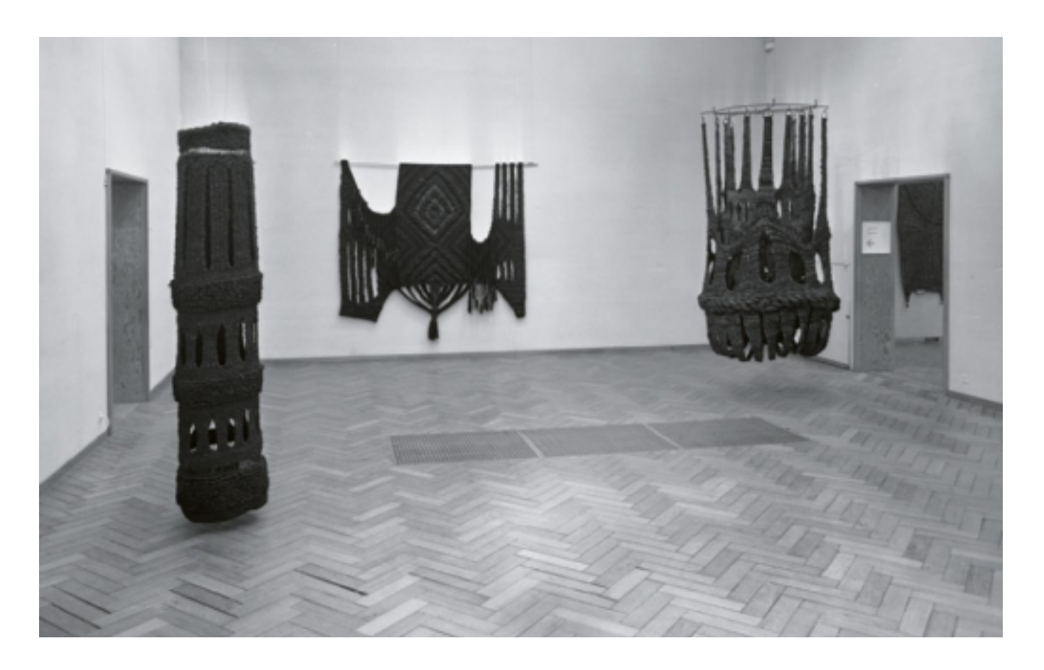
Installation view of Perspectief in textiel (Perspectives in Textile ), 1969, Stedelijk Museum Amsterdam

linked; the personal is political, and vice versa. The more we began to unpack the medium and its deep history, the more we confronted the fact that textiles themselves are extraordinary carriers of messages, communicating complex layers of meaning and speaking to histories of marginalisation: how they have been gendered (often historically seen as feminine or 'women's work'); how they have been instrumentalised to reinforce hierarchies of value in relation to craft; how they materially manifest globalisation, trade and labour economies; how they reflect histories of movement and displacement; how they have embodied potent knowledge systems (often rooted in nature) that have been extracted, co-opted and appropriated through colonialism; and more. Textiles have been embraced and reclaimed by artists for all these reasons, and it's these associations that stimulated our imaginations and led us to develop the thematic structure for the exhibition. Ultimately, we realised that we were not interested in telling a linear history of fibre art. instead we wanted to craft a porous, hybrid exploration of how textiles hold incredible power, knowledge and political potential.